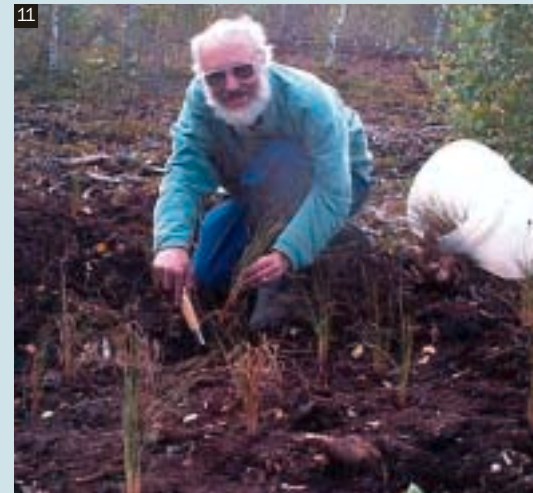
11. planting in Wainfleet Bog

Under the Canada-Ontario Agreement Respecting the Great Lakes Basin Ecosystem (COA), the governments of Canada and Ontario have recognized both the intrinsic environmental necessity and economic value of wetlands. Together with private and public sector partners, Canada and Ontario have undertaken field studies that show the value of wetlands, as well as projects that protect threatened sites and rehabilitate damaged ones.