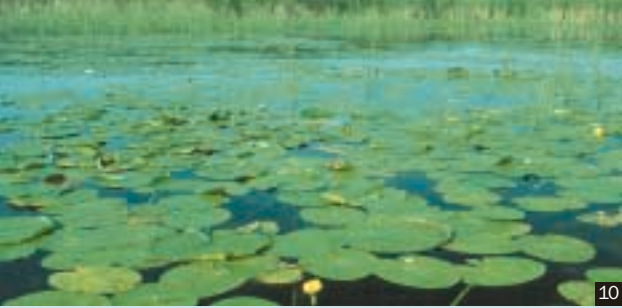
10. water lilies