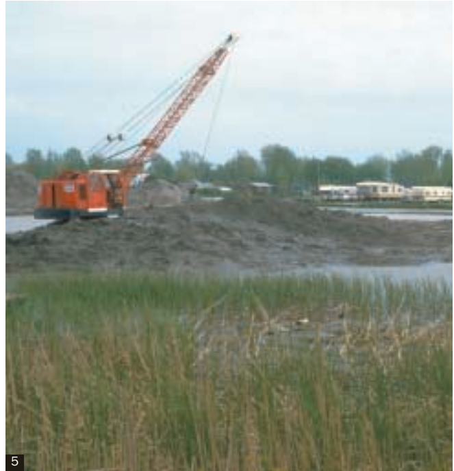
5. Wetland degradation through in-filling

Monitoring is being done to determine the effect on water levels and ensure that neighbouring properties are protected from any changes on the site. “We are doing a comparative study to see the effect of all these projects on water levels,” says Frohlich. “That way, we can make modifications should anything start to go awry.”