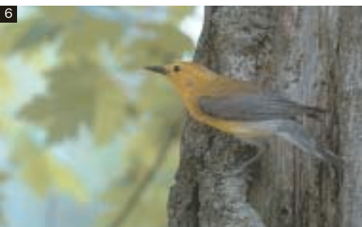
6. Prothonotary Warbler 7. Great Lakes wetland 8. spotted turtle

Throughout the Great Lakes Basin, fish and wildlife habitat will continue to be restored and protected through targeted actions such as those described above. Aquatic, wetland and upland habitat in Areas of Concern will continue to be rehabilitated in order to re-establish native plant and wildlife populations. And under the new COA, the governments of Canada and Ontario will continue to monitor and study wetlands to better understand the valuable role they play in maintaining the environmental health of the basin.