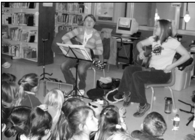
ECMA children's music nominees the Wilderbeets perform in the Children's Loft at Confederation Centre Public Library during ECMA week.

Community Legal Information Association. Staff from CLIA will be presenting information about the Association and provide legal information on a variety of topics such as wills, powers of attorney, health care directives, separation & divorce, child support, changing your name, youth justice, etc. There should be something for everybody, so bring your questions.