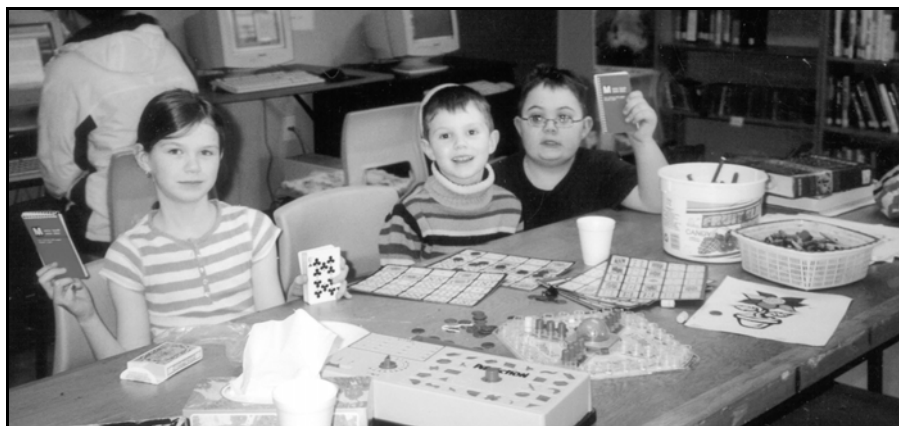
Children enjoy games day at the Tignish Public Library during March break.

Christmas Party. For Children ages 5 to 10 years. We will have a Christmas Craft, Story Time, and decorate Ginger Bread Cookies.