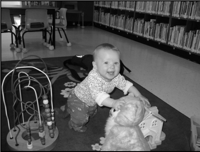
A baby lapsit participant enjoys playing with "Abbycat" in the Children's Loft at Confederation Centre Public Library.

Toddler Story Time. This is a 20 minute program of stories, games, rhymes for two year olds followed by a simple craft. Children should be present for both the reading and activity part of the program. Pre-registration is required.