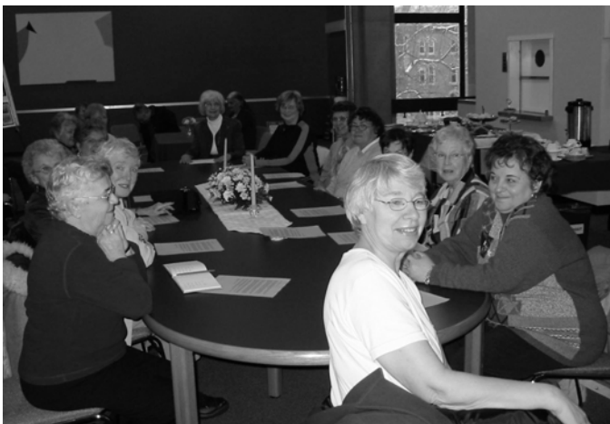
Friends of the Confederation Centre Public Library attending the Volunteer Appreciation Tea at the library.

UNICEF Christmas cards. Again this holiday season UNICEF cards will be for sale at Confederation Centre Library. Remember "Every purchase helps a child".