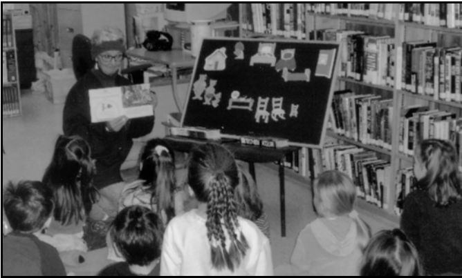
Kinkora Public Library volunteer shares a flannelboard story with a captive audience.

Christmas Craft. Children all ages welcome.