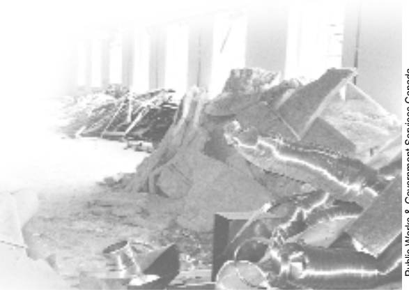
Public Works & Government Services Canada

A multi-departmental Industry Task Force is developing a best practice protocol for solid waste diversion in the construction, renovation and demolition industry.