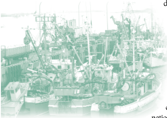
The Department of Fisheries and Oceans has been working with Small Craft Harbour Authorities to establish and implement environmental management plans.

which would reduce the introduction of plastic material and sediment into the Oshawa Harbour.