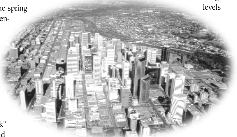
The Federal Smog Management Plan is helping reduce the release of particulate matter and ozone to the environment. During the summer months, every major Canadian urban centre has smog levels high enough to cause a health risk.

industrialized world. Air quality regulations to lower the allowable level of sulphur in gasoline sold in Canada were proposed in October 1998. The proposed regulations would reduce the sulphur content in gasoline to an average level of 30 ppm; this represents a 90% reduction from average levels