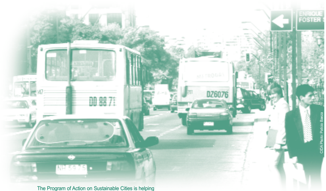
The Program of Action on Sustainable Cities is helping address the impact of urban activities on the environment.