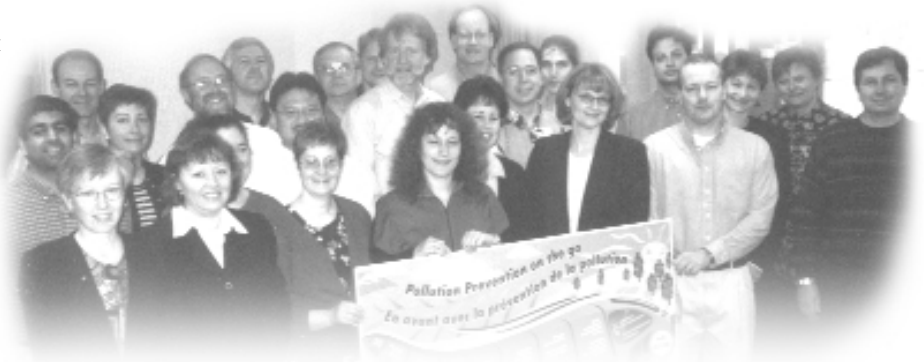
Annual meeting of the Pollution Prevention Coordinating Committee in Vancouver, May 1999.

To view Pollution Prevention— A Federal Strategy for Action, visit: www.ec.gc.ca/pollution/strategy