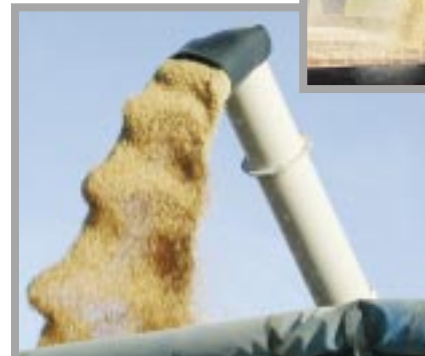
Canada is regarded as having the highest export standards in the world for its grains — and the equipment to move it.