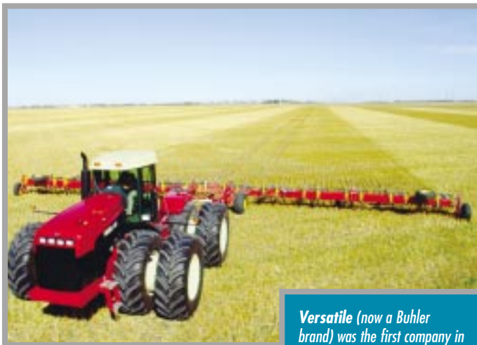
Versatile (now a Buhler brand) was the first company in the world to mass-produce a four-wheel-drive tractor.

Agricultural activity must be efficient. Canadian agricultural equipment is very practical — high productivity, low maintenance, reliability and ease of operation.