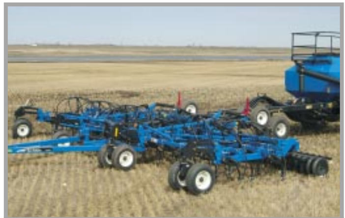
Canada is a world leader in air seeding technology and manufacturing expertise.