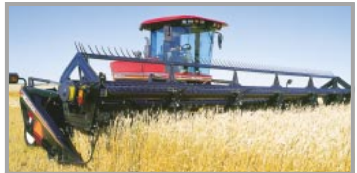
From single product focus to comprehensive product lines , Canadian companies meet all hay and forage equipment needs.

Canadian companies have extensive experience and outstanding capabilities.