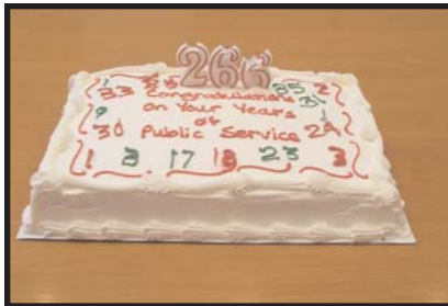
"266" represents the total years of public service work by the NFPC staff

At the NFPC, we are aware that diversity is more than ethnic or cultural diversification; it embodies all factors, internal and external, that makes each of us distinct, unique individuals!