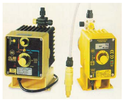
Figure 2: Chlorine Chemical Injection Pumps

required to allow the chlorine reactions to occur and to ensure that disinfection is achieved. Often small systems will incorporate a chlorine contact tank or possibly retention coils to achieve a desired chlorination contact time (often about 20 to 30 minutes depending on the design).