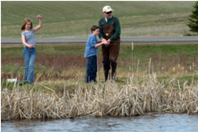
The Island boasts some of the best angling in some of the most beautiful natural areas you will find anywhere.

Fishing is a great way to escape the hustle and bustle of everyday life and spend time with your children, introducing them to the great outdoors. It's easy - if you've never fished you can learn along with your kids. It's inexpensive - a simple rod and reel, with bait and a bobber, will get you off to a good start. And, most importantly, it's fun!