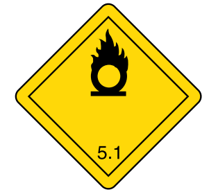
Class 5 Oxidizers and Organic Peroxides