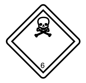
Class 6 6.1 Poisonous Substances