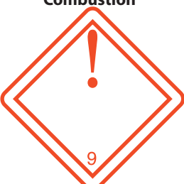
Class 9 Misc. Products and Substances