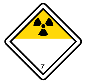
Class 7 Radioactive