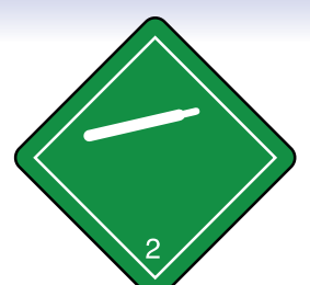
Class 2.2 Non-Flammable Non-Toxic