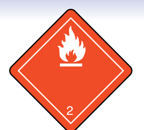
Class 2.1 Compressed Gas