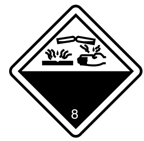
Class 8 Corrosives