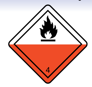
Class 4 Flammable Solids and Spontanious Combustion