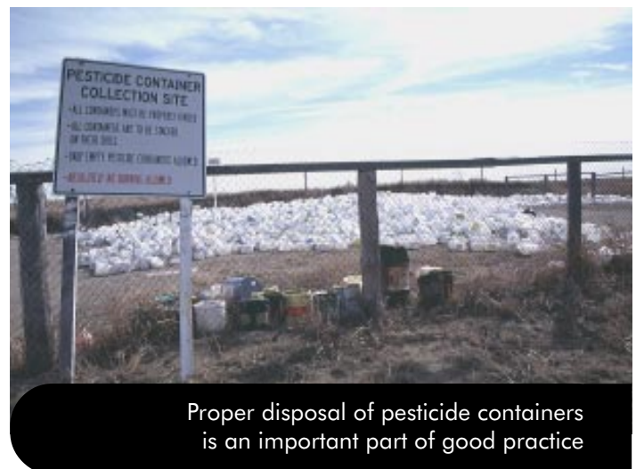
Proper disposal of pesticide containers is an important part of good practice

The use of herbicides and insecticides can be minimized through 'Integrated Pest Management'.