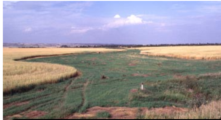
Grassed waterways act as buffers to trap sediment and nutrients

Where buffer zones surround a stream or lake, they are usually referred to as riparian buffers . These strips capture sediment and nutrients from water that is