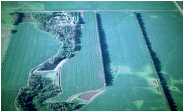
Farm practices that prevent erosion will help to protect surface water quality