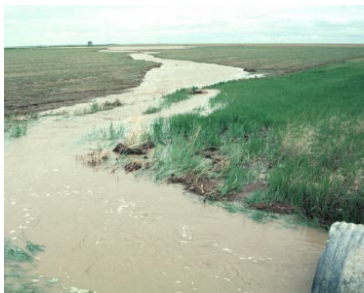
Sediments, nutrients and pesticides may be washed from agricultural land to surface runoff water