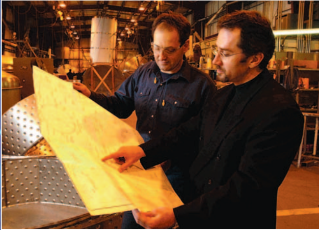
Diversified Metal Engineering Ltd. is an innovative Island company which helps employees keep their skills current through workplace education.

The year 2004 was proclaimed by Premier Binns as the Year of Learning and Innovation to commemorate 200 years since Lieutenant Governor Edmund Fanning dedicated land for the province's first college in 1804.