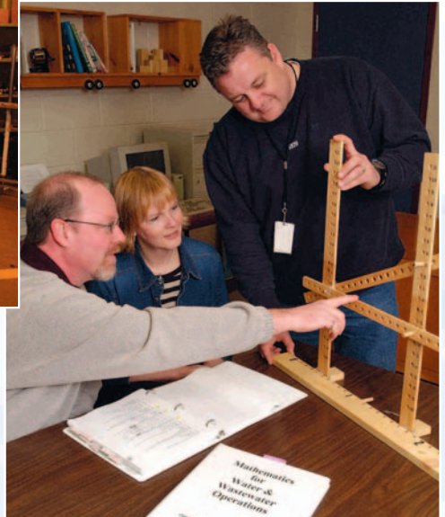
City of Charlottetown employees have upgraded their essential skills through education programs offered at their worksites.

Three Island companies have received national awards for excellence in workplace literacy programs in the past three years: Durabelt Inc., Diversified Metal Engineering Ltd and Royal Star Foods Ltd.