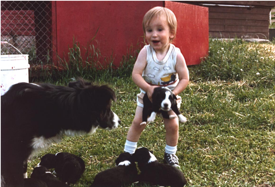
Bliss is a working mother.