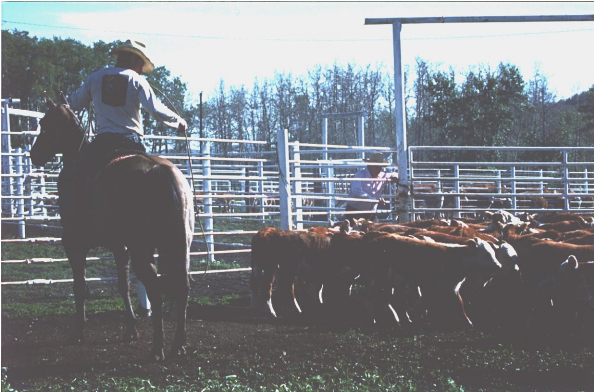
Both horses and dogs help ranchers with their cattle.