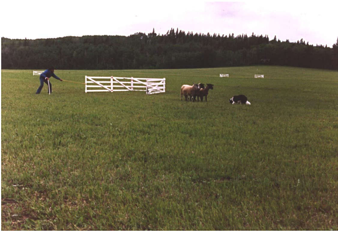
Creed moves in. Can he get the sheep into the pen?