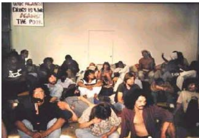
“A war against drugs is a war against the poor” reads a sign behind drug users settling for floor space at an early VANDU meeting held at the 4 Squares Street Church

Prior to these meetings, drug users had little input into discussions about the “health emergency” and the proposed responses. As one founder stated, “the voice of drug users had never been heard in government places, health offices, and higher bureaucracies.” By bringing the meetings to drug users and allowing all to participate, no matter how high they were or how bizarre their behaviour, the organizers were able to successfully document users’ concerns using a low threshold format. One founder noted that “it was almost a spiritual thing that we had talked about, that the cry of suffering users themselves, if that could be heard publicly, that was the most powerful weapon of all.” For the voice of users to be heard, a process of “demarginalization” first had to occur. As a founder stated: “The biggest obstacle to