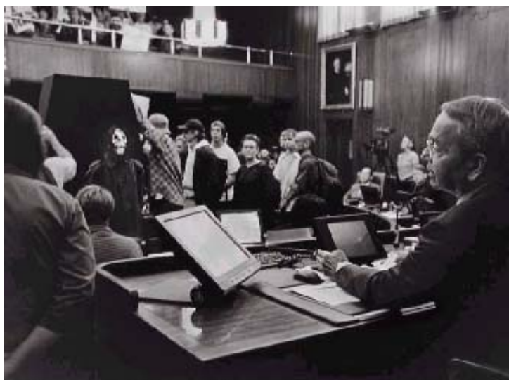
VANDU members interrupt a Vancouver City Council meeting after the Mayor announces a 90 day moratorium on the creation of new services for drug users. The Mayor halted the session and gave VANDU members time to voice their concerns

Almost everyone interviewed agreed that VANDU's primary strength is its ability to engage users on their own turf. This was a common theme that emerged from discussions with VANDU members and non-members alike. The belief is that because VANDU is driven by drug users, it is well positioned to help users in many ways. A funder noted: "VANDU is ideally positioned for secondary and tertiary prevention."