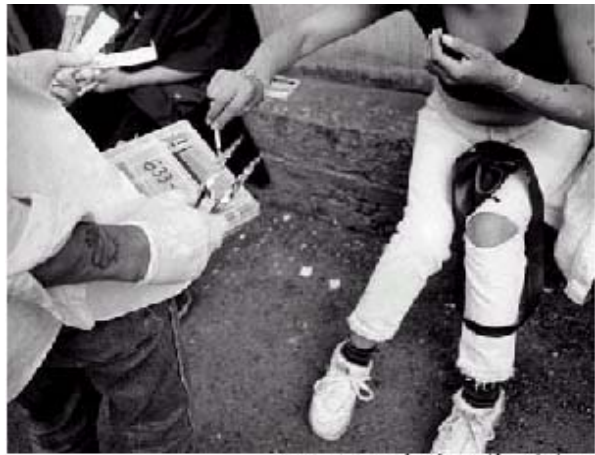
An alley patrol volunteer helps ensure that used syringes are discarded safely