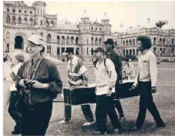
VANDU members carry a coffin to the steps of the provincial parliament buildings in Victoria

The Vancouver Area Network of Drug Users (VANDU) is a group of users and former users who work to improve the lives of people who use illicit drugs through user-based peer support and education. The population we serve includes people in the Downtown Eastside who self-identify as drug users, people on methadone, and street users of prescription drugs. Many VANDU members have HIV/AIDS, most have hepatitis C, and many are from a multi-cultural background. The health of our participants is enhanced by including users and former users in decision-making and task fulfilling opportunities which build self-esteem, trust, informal networks of support, and a sense of community. We advocate for "harm reduction" services for people who use drugs. VANDU is a voice for users in the community to aid in the reduction of overdose deaths and the spread of disease.