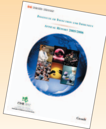
Annual Report ↑ 2005-2006