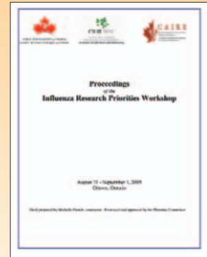
↑ Proceedings of the Influenza Research Priorities Workshop

These reports are available on our website: www.cihr-irsc.gc.ca/e/13540.html