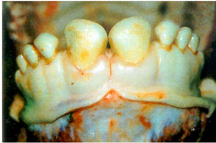
Cattle less than 30 months of age