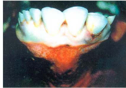
Cattle at 30 months of age

NOTE: For the purposes of certification of cattle and bison for export to the U.S., an animal is considered to be 30 months or older if either tooth of the second set of incisors has erupted through the gums.