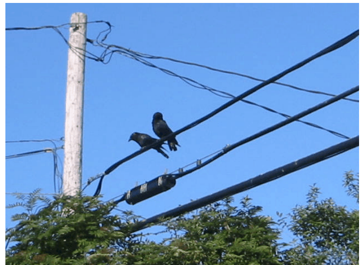
Figure 1: Normal & accidental hosts for WNV infection