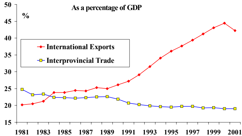
Chart 2 - Contribution of International and Interprovincial Trade to the Canadian Economy, 1981-2001

Source: Author's calculation using Statistics Canada data.