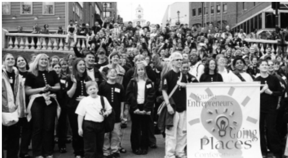
The Spirit of Entrepreneurship 2000, in Halifax, attracted hundreds of students from across Atlantic Canada