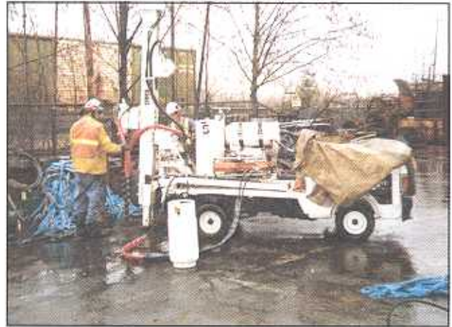
Borehole drilling at Anvil Way site to provide additional waste characterization data.

Approximately 4,000 m 3 of contaminated soil and slag exist on two industrial properties in Surrey, British Columbia. The principal radioactive contaminant is thorium, which was contained in niobium ore imported during the 1970s and which remained in the slag following smelting. Cleanup work during the 1980s resulted in the material being placed in interim storage on both sites pending disposal.