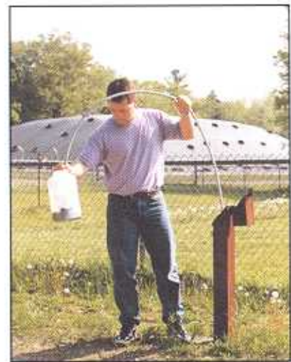
Port Hope environmental monitoring (water sampling) being performed at Rollins Ravine with the Temporary Storage Site in the background.

The LLRWMO continued to monitor the environment at known major on-land historic waste sites in Port Hope, to provide a level of management and security at these sites until a permanent disposal facility becomes available. The Construction Monitoring Program (CMP), a joint initiative of the town and the LLRWMO, continued operations in Port Hope. The program enables normal development to continue while preventing the inadvertent misuse of contaminated soil as backfill around buildings or at other locations. During the year, approximately 100 applications to the CMP were received. Cleanup was required at two properties resulting in the recovery of 25 m 3 of contaminated soil which was taken to the Pine Street Extension Temporary Storage Site in Port Hope. In addition, investigations and remedial work were performed at five residential properties in Port Hope as a result of failure of the F/P Task Force criteria; two of which involved contaminated building materials, two to reduce elevated radon gas concentrations and one property where contaminated soil was removed from below a basement floor. At the conclusion of these activities, all properties met the F/P Task Force criteria. The LLRWMO continued to provide technical and analytical support to the Port Hope Community Health Concerns Committee, a community group examining the health risks associated with the presence of low-level radioactive waste in the Town.