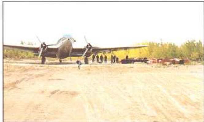
A Curtiss C-46 aircraft is being loaded at Sawmill Bay with drums of uranium contaminated soil for transport to Yellowknife.

The investigation identified an estimated 20,000 m 3 of uranium-contaminated soil at eighteen sites along the Northern Transportation Route north of Fort McMurray. Sites, where people were living in close proximity to contaminated materials, were cleaned up during the investigations. In the short-term, there is no need for action at the remaining sites along the Northern Transportation Route unless the use of the affected properties changes. The focus has now shifted to developing, in consultation with residents of the communities and government officials, an overall plan for cleanup and long-term management of the resulting wastes, while continuing to perform any surveys or other work necessary to accommodate local land use requirements.