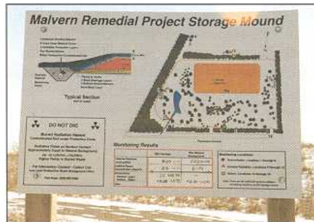
Monitoring of the MRP Passmore Avenue site continues with the most recently collected data being posted on a sign at the site.

The Malvern Remedial Project (MRP), a joint Canada/Ontario project to complete the cleanup in the Malvern area, was announced in 1992 March. The MRP resulted in the removal of radium contaminated soils from more than 60 residential and 3 commercial properties in the Scarborough community of Malvern, resolving a long-standing concern in the community. The planning and approval phase of the project was completed in 1994. Removal of contaminated soil and low-level wastes, along with restoration of the properties took place in 1995 and 1996. Contaminated soil was placed in an engineered storage mound, and stored at Passmore Avenue, a nearby industrial site, while the low-level wastes were sent for storage at AECL Chalk River Laboratories.