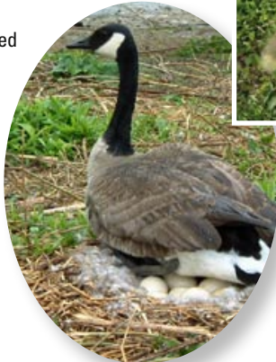
The Giant Canada Goose is the most common sub-species of Canada Geese breeding in rural southern Ontario.

NESTING: By mid-April, most female geese are sitting on their nests. Preferred sites are near water, such as small islands, and the shorelines of ponds and wetlands. While nesting, geese may become aggressive toward people or their pets in defence of the nest. If the nest is destroyed, geese may attempt to re-nest nearby.