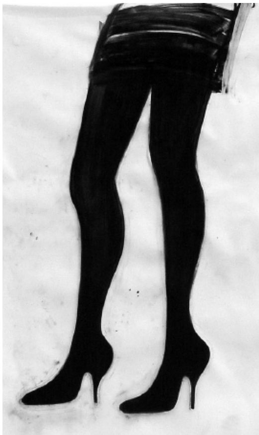
Untitled, by Cathy Daley (Calgary's Newzones Gallery, Affordable Art Fair participant)

Participants had the opportunity to meet with key industry figures, who provided information and advice about various aspects of the art market, including an overview of the New York contemporary art scene, tips about generating publicity and little-known facts about the cross-