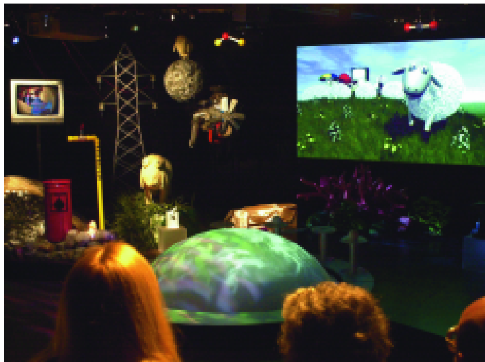
The Climate Change Show, Sudbury-based Science North Enterprises' object theatre exhibit

Visit the Export USA Calendar at: www.dfait-maeci.gc.ca/can-am/export