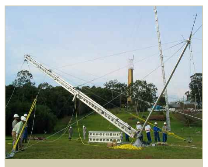
SBB International's emergency electrical towers

SBB International has revolutionized the market for emergency electrical towers. The company has spent 10 years and over $1.5 million developing this fast-mounting tower for the transmission of electricity. In Brazil, the company has sold more than 85 emergency towers valued at more than $6 million. Its towers each provide up to 500 kilovolts of power, are composed of modular aluminum components and can be erected in just three hours.