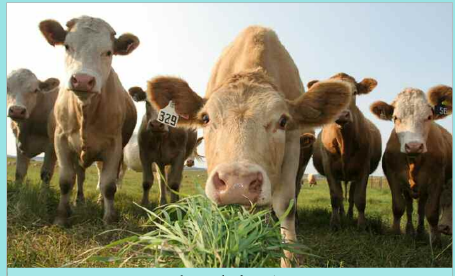
Take a number for service?

"Resolving market access issues for beef and cattle, based on sound science, is one of the Government's key trade priorities," says David Emerson, Minister of International Trade. "This is an important milestone in our efforts to restore market access for Canadian