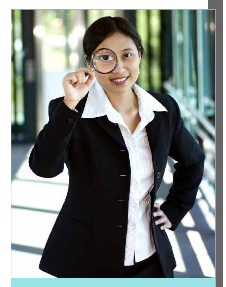
When it comes to exporting, look before you leap.

Does the supplier have experience with Canadian companies? If possible, seek out any Canadian businesses that have worked with the supplier. Ask them about their experiences, both positive and negative.