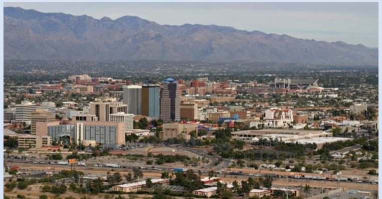
Downtown Tucson, Arizona, with a view of the University of Arizona in the background

Canada is also the largest foreign investor in Arizona with major Canadian companies such as