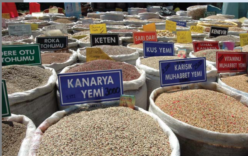
Seeds for sale at Istanbul's Grand Bazaar, Turkey's largest covered market

Over the past few years, Turkey has transformed itself into a dynamic, modern economy. Reforms that began in the 1970s, and reinvigorated after 1999, have propelled Turkey's economy from a rural to a modern, industrial one. It now ranks as the 21st-largest economy in the world, with a gross domestic product (GDP) of approximately $345 billion.