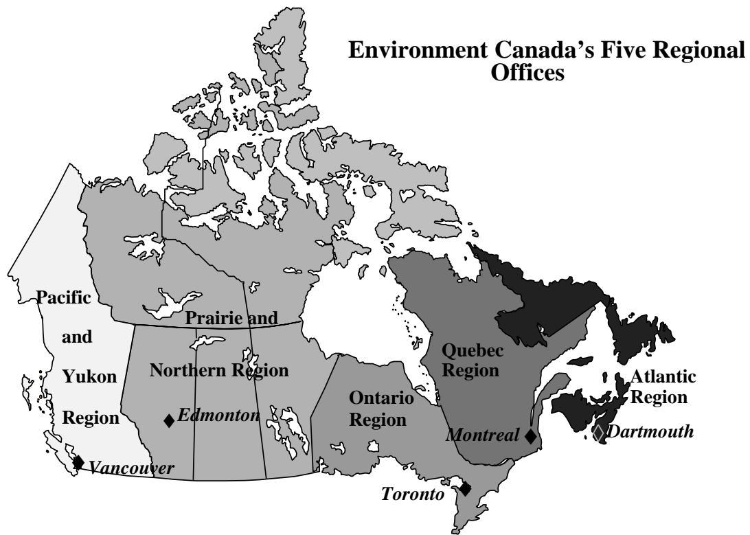
Map 2: Environment Canada's Regions and Offices