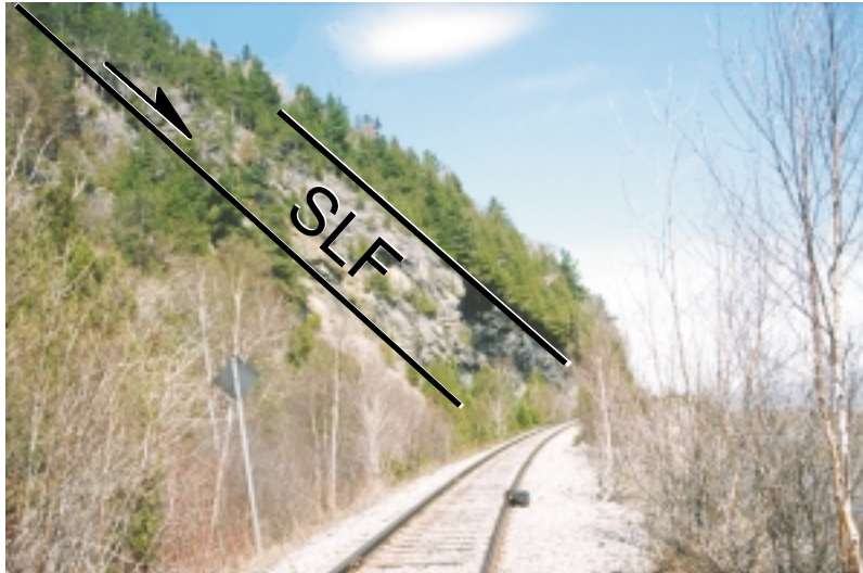
Figure 2. Panoramic view of the St. Lawrence Fault (SLF) at Sault-au-Cochon. Fault breccia and cataclasite are exposed along the shoreline at the base of the cliff. View toward the northeast.