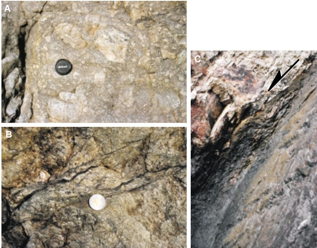
Figure 3. Field photographs of fault rocks of the St. Lawrence and Cap-Tourmente faults. A) Fault breccia of basement rocks along the St. Lawrence Fault at Sault-au-Cochon. B) Veinlets of dark-coloured pseudotachylyte in highly fractured basement rocks at Sault-au-Cochon. C) Foliated gouge of the St. Lawrence Fault at Sault-au-Cochon. Vertical view toward the southwest. Note nascent shear bands indicating normal-sense faulting.