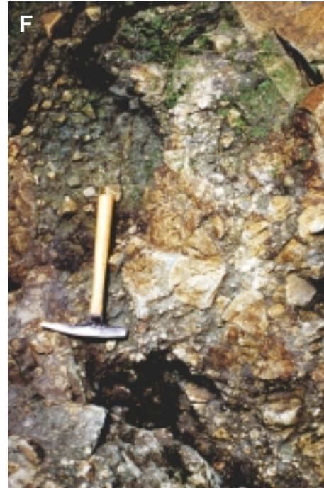
Figure 3. D) Close-up of fault gouge of the St. Lawrence Fault at Sault-au-Cochon. Note the faintly developed fault fabric. E) Fault breccia of the Cap-Tourmente Fault. F) Fault breccia with a composite matrix of crush breccia and pseudotachylyte (dark-coloured material) at Cap-Tourmente.