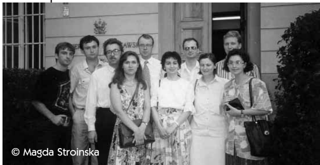
Some students at the Actuarial Summer School in Warsaw in 1993

One of Canada's education-related projects in Poland involved a summer actuarial training program at Warsaw University. Professors from the University of Western Ontario travelled to Poland to administer this very specialized training program.