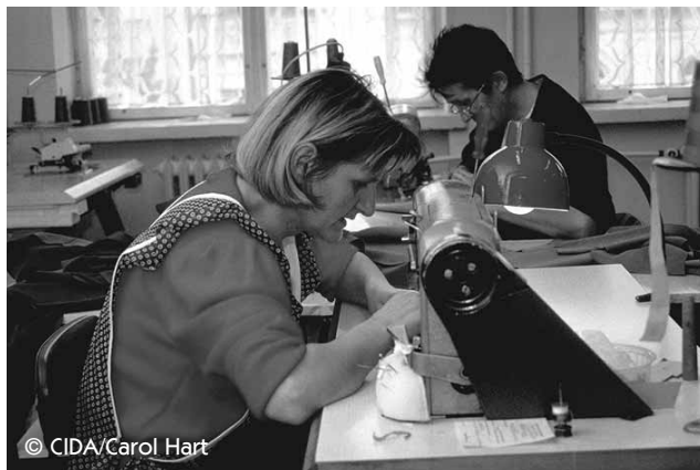
Employees of a small enterprise manufacturing clothing in Ozorkow, part of the small business development program with Confederation College.

Several CIDA projects, including the flagship Canada-Poland Entrepreneurs Fund, contributed to these efforts. Assistance was provided in the area of training, business advisory services, institutional capacity building, management instruction, and technical, financial, and operating advice. For example,