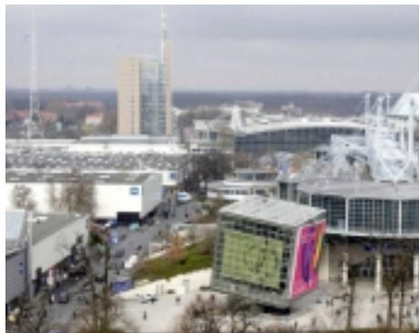
CeBIT fairground in Hannover

Canadian ICT companies to tap into new market opportunities in the European Union, Asia, the Middle East, and the Americas. Close to 150,000 of the visitors in 2002 came from outside Germany.