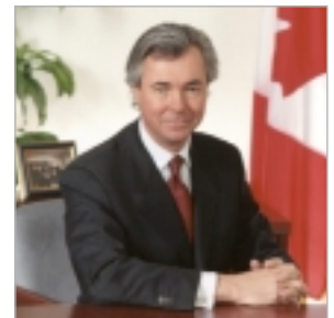
International Trade Minister Pierre Pettigrew