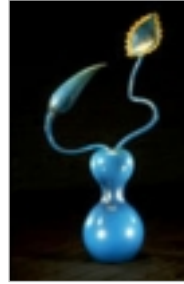
World-renowned glass artist Dale Chihuly's "Gilded Ethereal Blue Ikebana With Two Stems"

The mission will include a full-day educational session with industry experts, access to SOFA Chicago and networking opportunities at the international reception. With SOFA's 80 galleries