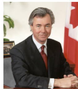
Pierre Pettigrew, Canada's Minister for International Trade, will take part in the Canada-Korea celebration.

S EOUL, KOREA — October 20-21, 2003 — This year marks the 40th anniversary of diplomatic relations between Canada and Korea and 30 years since the Canadian Embassy first opened in Seoul. To commemorate these anniversaries, the Embassy has launched Celebration 2003 , a year packed with