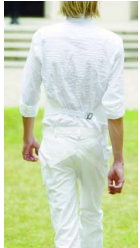
Dubuc's fashions won raves from the French fashion elite.

France, alongside Italy, England and the United States, is one of the leading international networks for the creation, dissemination and marketing of fashion, and the Canadian clothing industry has made the French market a priority. In fact, 16 companies from British Columbia, Ontario and Quebec intro-