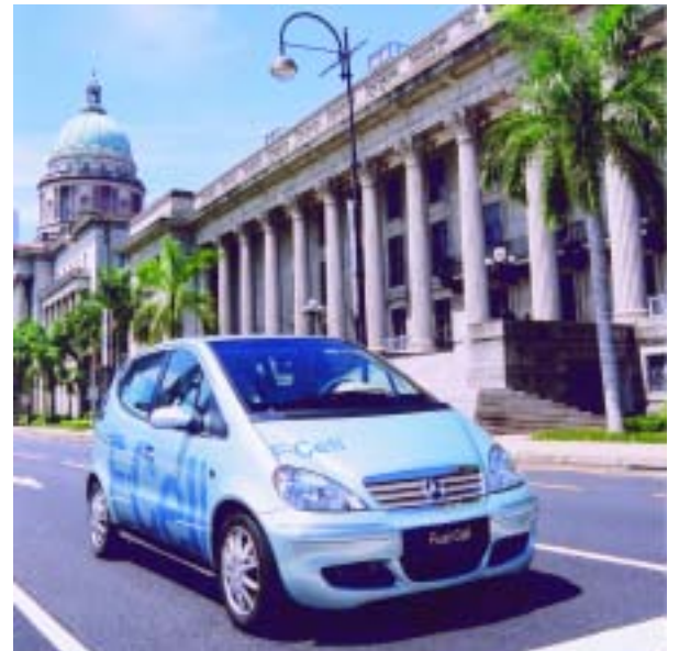
Southeast Asia's first fuel cell car, powered by Vancouver-based Ballard Power Systems.