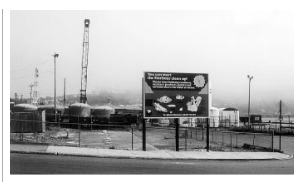
The Halifax Harbour Cleanup Campaign seeks to involve all stakeholders, including homeowners, to reduce the release of non-biodegradable and toxic products into the Atlantic Ocean along with sewage.