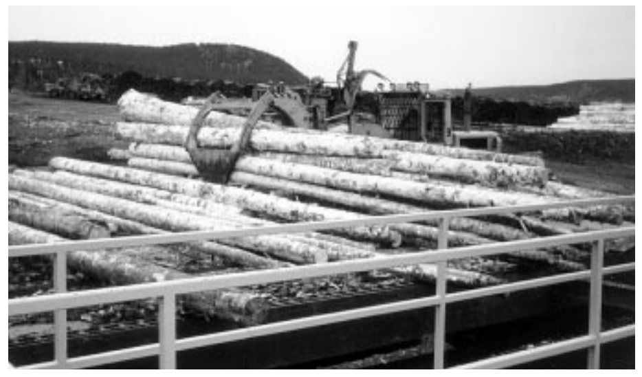
Riverside Forest Products, together with Environment Canada, co-funded and began a pollution prevention planning project at the Williams Lake Sawmill.

Environment Canada organized information sessions for industry on the new regulations governing biotechnology products and the limits on benzene in gasoline.