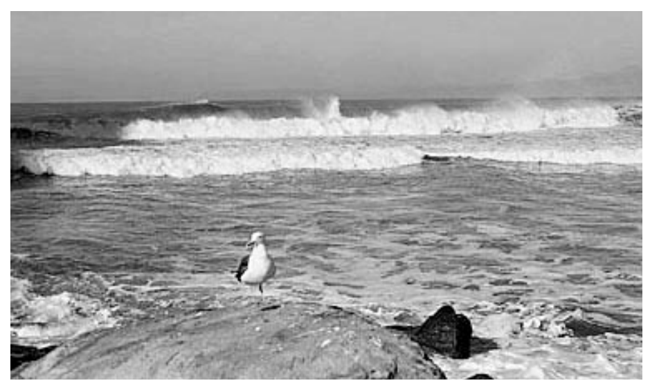
Eastern and western shorelines are at risk from city, industrial and marine traffic pollution.

The Canadian Council of Ministers of the Environment developed a Pollution Prevention Awards Program with assis-