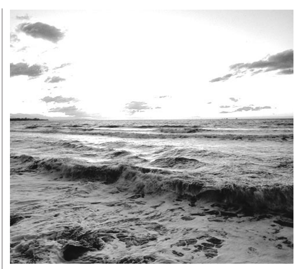
Canada and the United States have worked together for decades to restore and protect the Great Lakes.

Memoranda of understanding between Canada and China, and between Canada and Korea, were led by Environment Canada – Pacific and Yukon Region and focused on development and sharing of industrial pollution-prevention processes and technologies. PP