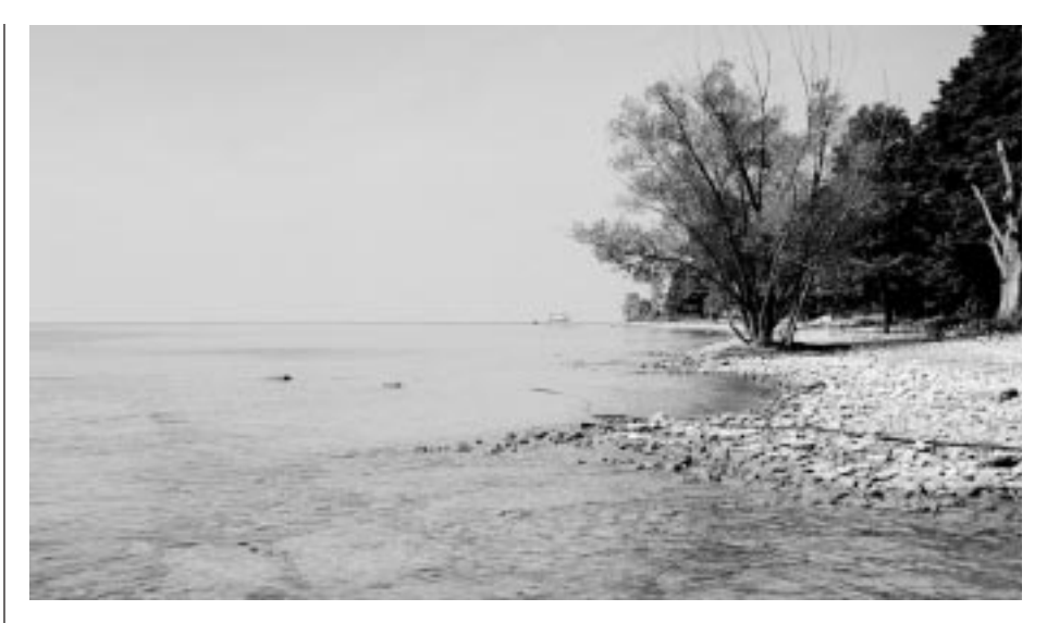
Lake Erie is a shallow, ecologically sensitive lake. Its deterioration prompted the United States and Canada to sign agreements in 1972 and 1978 for control of phosphorous loading into the lake.

and achieved significant results in water and energy conservation.