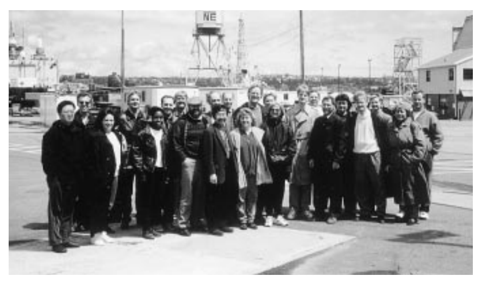
The members of the Pollution Prevention Coordinating Committee met at the Pollution Prevention Roundtable in Halifax, May 1997 (Canadian Forces Base Halifax).

Although the Government of Canada takes leadership in promoting pollution prevention, organizations at all levels – from local residents to multi-national corporations – are encouraged to take responsibility for their actions and for preventing pollution.