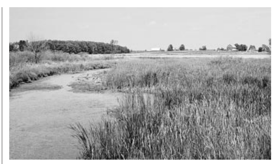
Wetlands act as buffer zones between natural and agricultural areas.