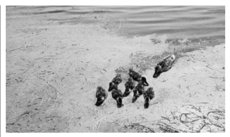
Prairie potholes or "sloughs" are essential to the survival of many species of waterfowl, such as this family of mallards.

was delivered in cooperation with Environment Canada, Prairie Farm Rehabilitation Administration, Canadian Water Resources Association, Saskatchewan