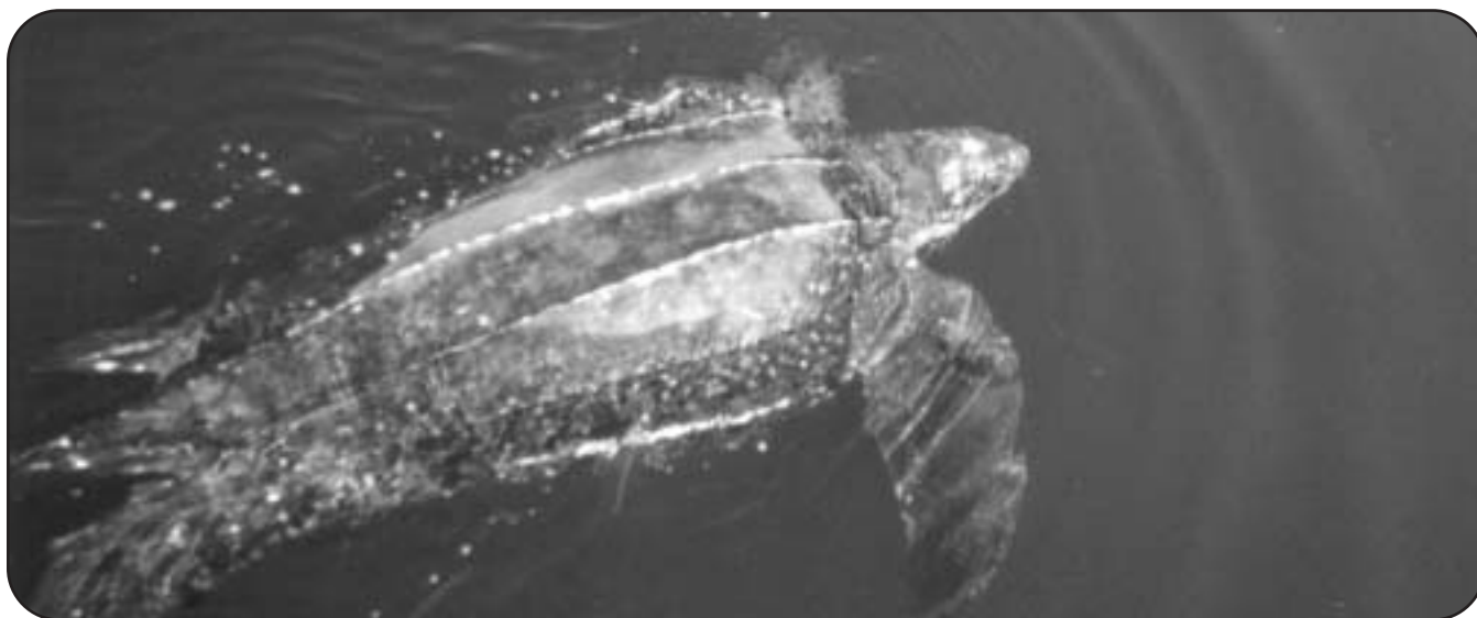
Figure 1. Basking

Like all sea turtles, leatherbacks cannot retract their head or flippers under their shell as tortoises and freshwater turtles can.