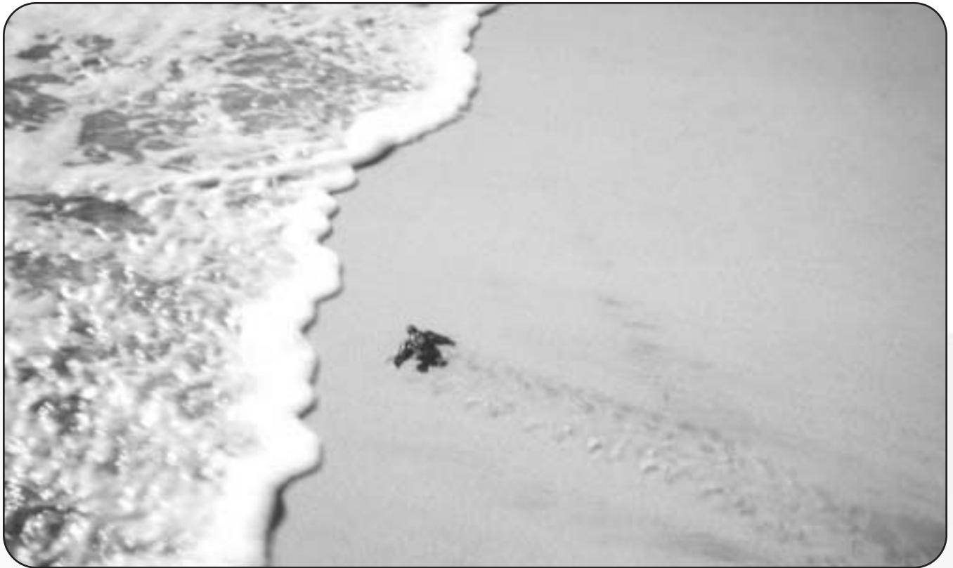
Figure 4. Hatchling, R. Ganley, NSLTWG

Another mystery surrounding leatherbacks is where hatchlings go between the time they are small and the time they return to the nesting beaches as adults. Sightings of juvenile turtles are extremely rare, and there is little information on the biology, distribution or habits of young turtles, although recent research suggests that hatchlings remain in tropical waters until their carapace is a metre long.