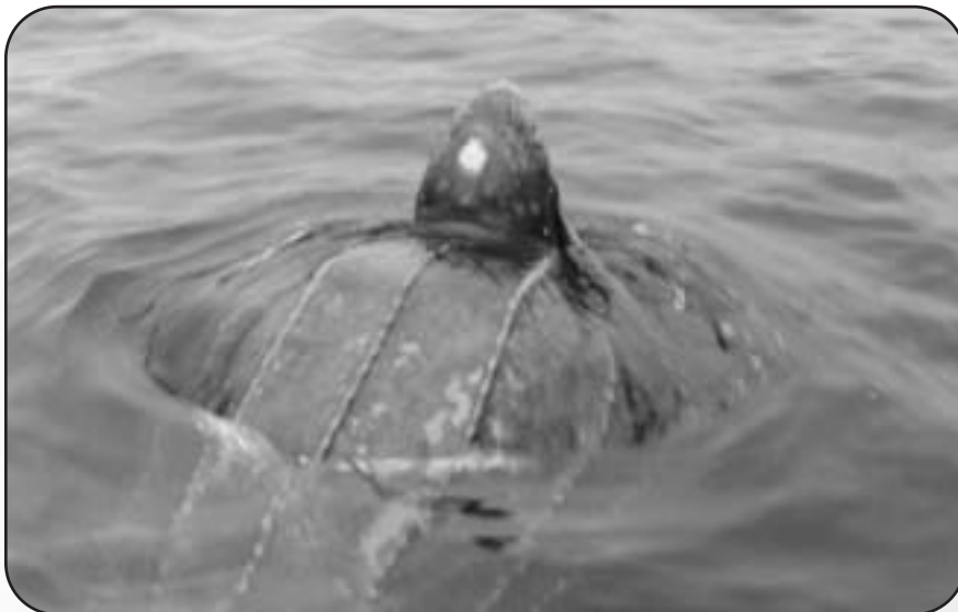
Figure 2. Feeding, D. Ivany, NSLTWG

Like all turtles, leatherbacks do not have teeth. They do have two cusps (pointed parts) on their upper jaw and one on their lower jaw, although these are not used to “chew” food, but to grab it. To aid in feeding, the leatherback's entire