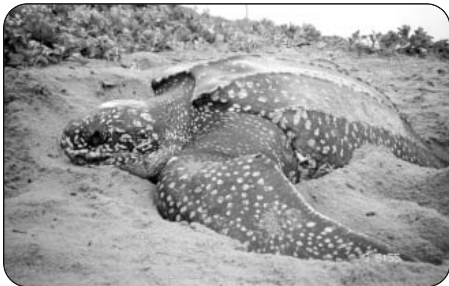
Figure 3. Nesting, M. Godfrey

esophageal tract is lined with sharp spines that point downward. Scientists suggest that these spines prevent jellyfish from escaping from the leatherback's mouth, and they help to shred the jellyfish to pieces as it travels down the esophagus to the turtle's stomach.