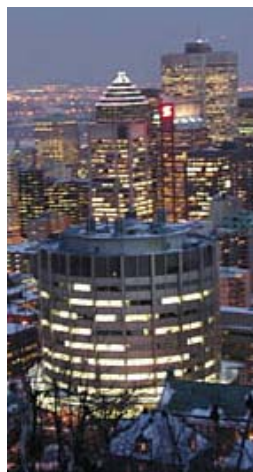
Home of ICR, McIntyre Medical Sciences Building at dusk.

ICR is also supported by an advisory board of seventeen individuals drawn from the full spectrum of the cancer research field, from lay persons and survivors to molecular geneticists, epidemiologists and clinicians.