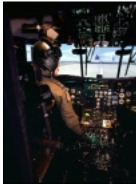
CAE's MSH Chinook simulator.

To that end, in February 2001, at CAE's request, the Canadian High Commission in Singapore arranged for representatives of CAE, and its Singapore agent, to meet the Director of Procurement at the Singapore Defence and Science Agency (DSTA). The resulting strengthening of ties and rapport with key DSTA contacts proved invaluable —