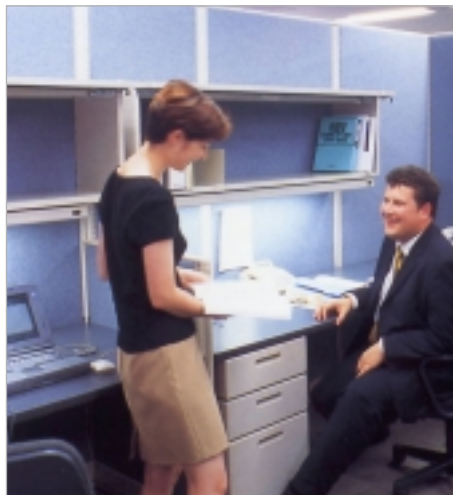
Office space in a Business Support Center in Japan.

BSC staff will also help arrange for the services of interpreters, translators, administrative staff, business travel coordinators, accountants, lawyers, and investment consultants (such as