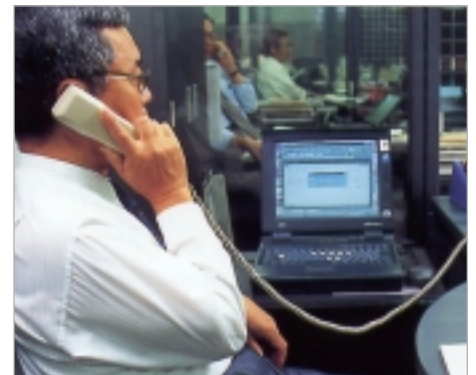
An advisor's desk in a Business Support Center.