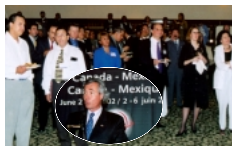
International Trade Minister Pierre Pettigrew (inset) addressing Canadian and Mexican business people during the networking luncheon in Monterrey.

"We're confident that the economic recovery now underway will see a resurgent Mexico within North America," said Minister Pettigrew. "This trade mission allowed us to create stronger trade ties between Canada and Mexico — a success in which both countries will share for years to come."