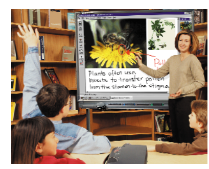
The SMART Board<sup>TM</sup> interactive whiteboard in an educational setting