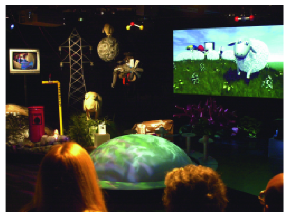
The Climate Change Show, Sudbury-based Science North Entreprises' object theatre exhibit

The mission also tied into the annual National Manufacturing Week Trade Show, which is the premier manufacturing fair in North America, with six integrated conferences and exhibitions. It features the latest in design, engineering, manufacturing and innovation. Last year, the show attracted some 1,500 companies that presented their products and services to over 30,000 attendees from 48 states and 28 countries. A TNO pavilion showcased the products and services of the delegation and other Northern Ontario companies and organizations.