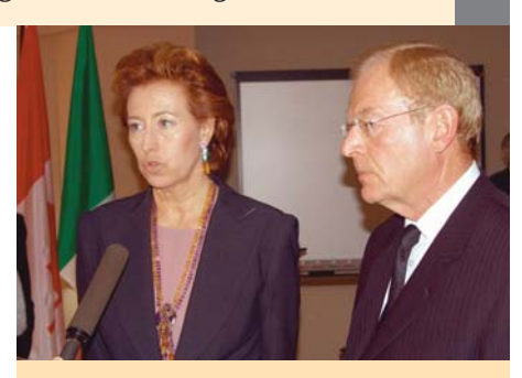
International Trade Minister Jim Peterson and Italy's Minister of Education, University and Research, Letizia Moratti.

"As Canada is moving forward with our International Policy Statement, we are placing significant emphasis on relationships that already exist, such as the one with Italy," said Minister Peterson at the signing ceremony. "We look forward to these joint projects, resulting in commercialization and greater competitiveness for small and medium-sized enterprises." see page 2 - Science and technology statement