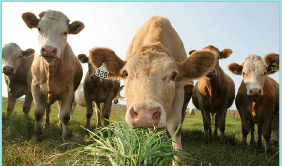
Take a number for service?

“Resolving market access issues for beef and cattle, based on sound science, is one of the Government’s key trade priorities,” says David Emerson, Minister of International Trade. “This is an important milestone in our efforts to restore market access for Canadian