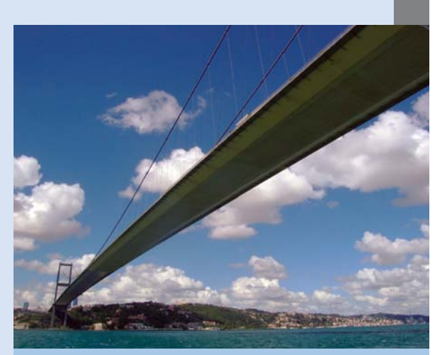
Bridge over the Bosphorus, Istanbul.

The conference will highlight the experiences of leading Canadian companies already successful in the region and will coincide with the visit of a Turkish business delegation visiting North America. The event is being organized with the support of International Trade Canada, Foreign Affairs Canada and Export Development Canada (EDC). Together with international financial institutions, EDC will discuss financing strategies for this market. The conference will offer a frank assessment of what is possible in a region with huge potential. To allow access to panellists and senior executives, seating will be limited.