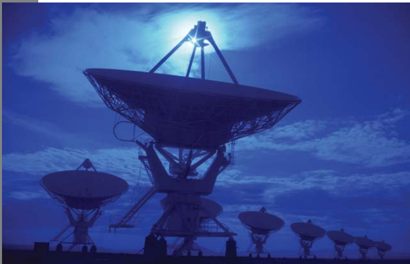
Satellites, whether for military or civilian use, require export permits.

Do you need an export permit for your product? This is a key question that's often overlooked. In fact, many Canadian exporters will only discover the answer when their product hits a roadblock at customs.