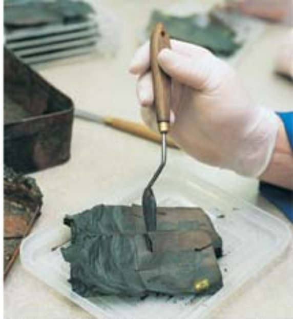
Staff in the Mutilated Note Service carefully sift through charred bank notes. Each year the Bank is asked to identify, for reimbursement purposes, the value of notes that have been burned, decomposed, torn, shredded, or contaminated.

Bank notes have a limited lifespan. The Bank of Canada is responsible for replacing and destroying worn notes. When financial institutions return notes to the Bank, we select those that are no longer fit for circulation, shred them, and send them to landfill sites.