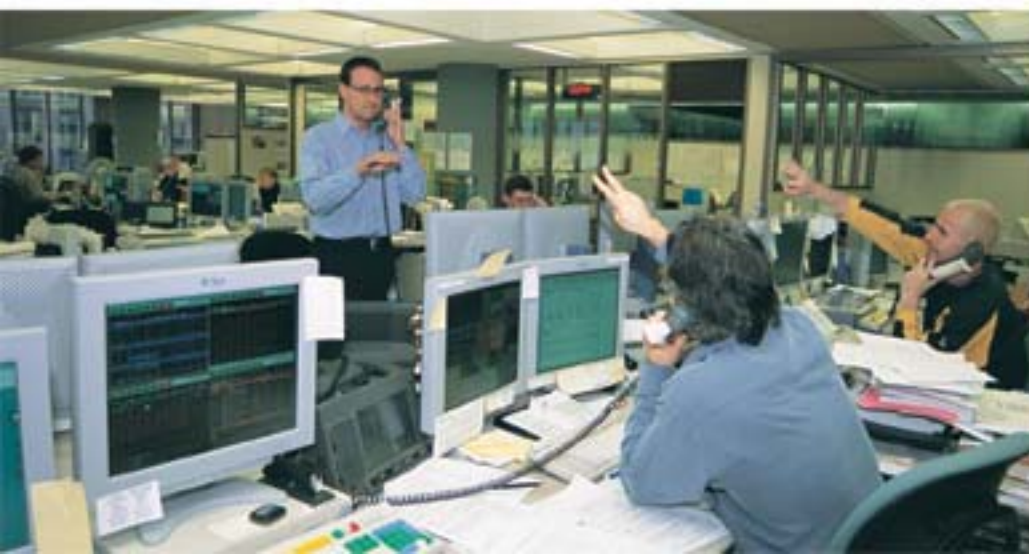
Action in the Bank's trading room

The federal government finances its operations primarily through taxation and borrowing. Most of that borrowing is done by issuing Government of Canada bonds and treasury bills. The Bank of Canada advises on, and manages, these issues of securities. The Bank also makes sure that the government has sufficient cash balances to meet its daily requirements and invests any excess balances. The Bank advises the government on its investment policy for foreign exchange reserves and manages those reserves.