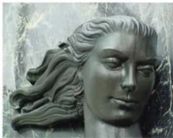
Detail of bronze panel on front of head office building

The Management Forum meets regularly to exchange information on management issues and to review corporate policy proposals. The Forum consists of the Executive Management Committee, advisers, department chiefs, and the directors of human resources and information technology.