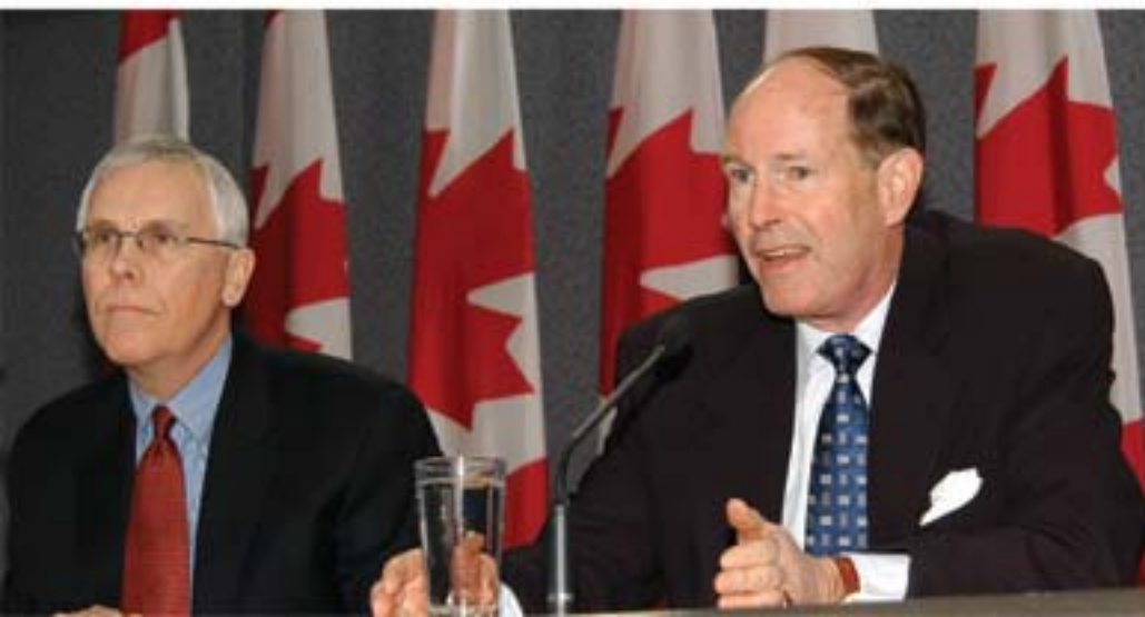
Senior Deputy Governor Paul Jenkins and Governor David Dodge at a press conference for the release of the Monetary Policy Report Update .

Monetary policy decisions are made by the Bank's Governing Council, which includes the Governor, the Senior Deputy Governor, and four Deputy Governors. The strategies, policies, and economic analysis behind these decisions are explained four times a year in the Bank's Monetary Policy Report and the Update , as well as in regular speeches by members of the Council. The Bank also explains the reasons for its interest rate decisions in a press release each time it announces its target for the overnight rate.