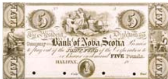
Prior to the establishment of the Bank of Canada, chartered banks provided most of the bank notes in circulation. These notes were redeemable for gold coins or Dominion of Canada notes.

government became the Bank's sole shareholder and remains so today.