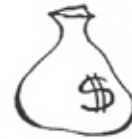
Financial Resources & Accountability