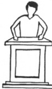
Political Will & Leadership