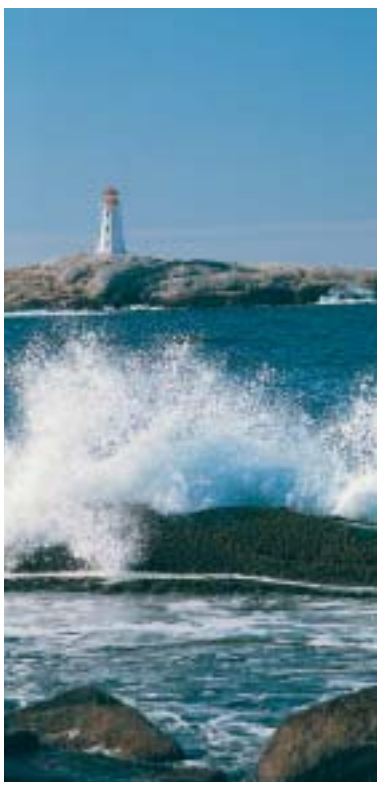
Nova Scotia: Canada's Seacoast.

Since its creation in 1997, the Nova Scotia Tourism Partnership Council (NSTPC) has enabled industry to have direct input into how the province markets itself to the rest of Canada and the world.