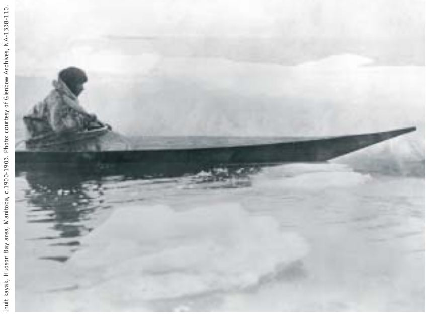
The Glenbow Museum in Calgary invites visitors to embark on an authentic northern experience of Inuit life and culture. Inusivut: Our Way of Life tells of survival and innovation, the story of the people and cultures of the Arctic. The exhibition opens June 14 and runs until September 21, 2003.

wine tourists will benefit the Canadian dairy industry. The two associations have formed a two-year alliance which will enable them to develop educational wine and cheese seminars at four annual festivals.