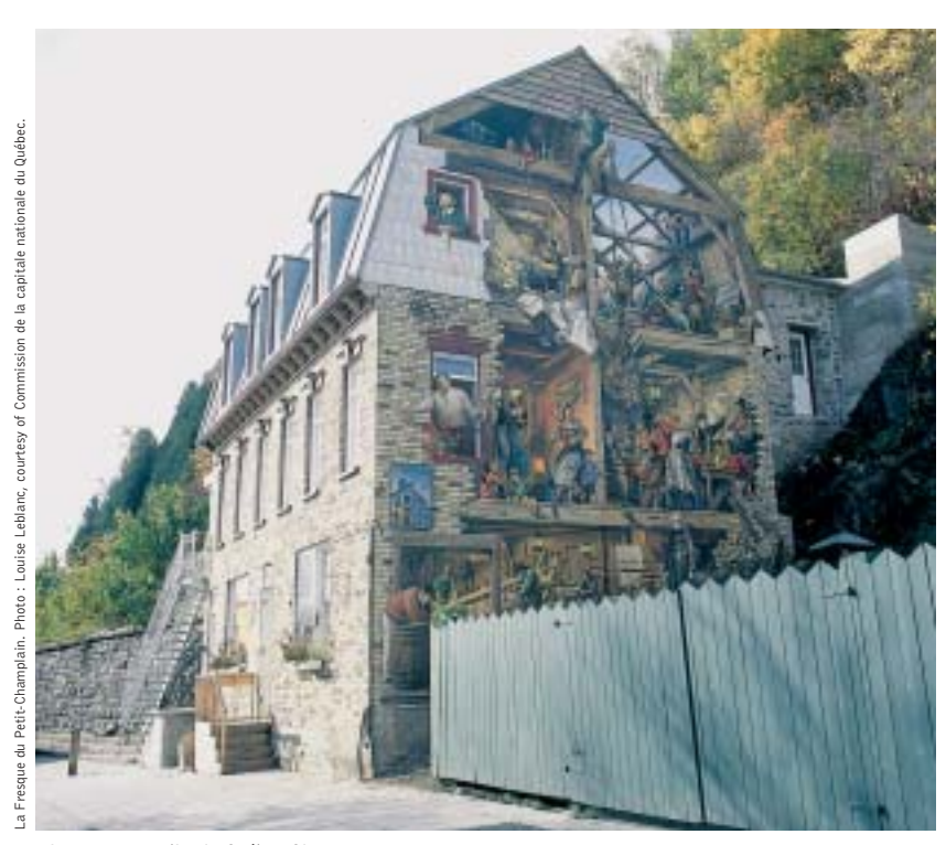
History comes alive in Québec City.

Toronto's cultural scene, one of North America's most dynamic,