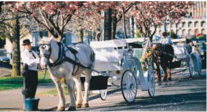
Victoria: The City of Gardens.

In the city's St. Boniface area, the largest French-speaking community outside Quebec invites visitors to Fort Gibraltar on the banks of the Red River, where they can walk back 200 years in history to the time of the Voyageurs and the fur trade in the Northwest.