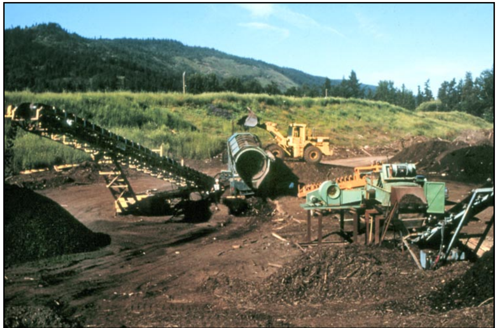
Sortyard residues were separated using a trommel screen. Analysis of the chemical and physical characteristics of the finer fractions revealed that this material should be suitable as a soil amendment.

Gaining a better understanding of the organic makeup of sortyard fines is an important step for creating new oppor-