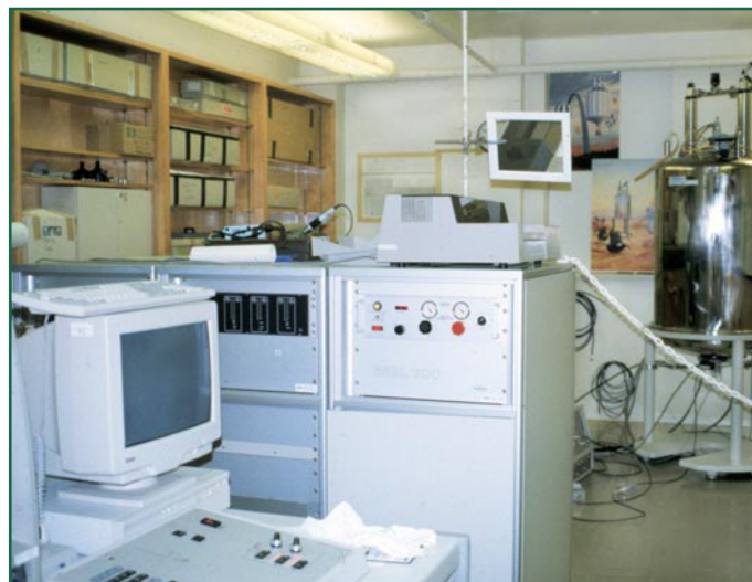
NMR equipment at the Pacific Forestry Centre

An analytical technique called Nuclear Magnetic Resonance spectroscopy with cross-polarization and magic-angle spinning ( ^{13}\text{C} CPMAS NMR) was used to get a better understanding of the organic matter. This technique provides a fingerprint of the carbon structures in the sortyard fines. It is the best available technique for dirty, complex and insoluble materials.