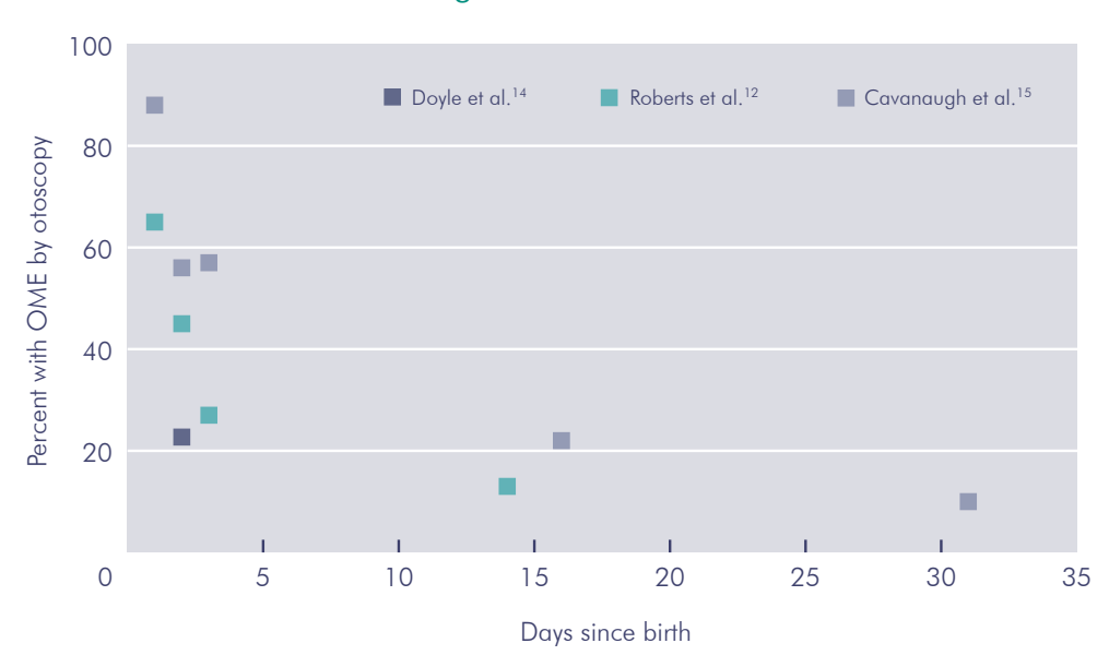
Figure 1: Natural History of Clearance of Amniotic Fluid from the Middle Ear following Birth

Most newborns referred for audiologic diagnostic evaluation from EHCD programs are subsequently found not to have PCHI. Retained amniotic fluid is a hypothesized cause for false-positive results on newborn hearing screening. Amniotic fluid takes many days to clear from the newborn's middle ear (see Figure 1).