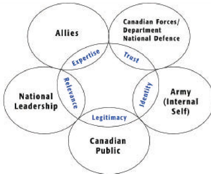
Figure 1: Relational facets of the Army's Centre of Gravity

For the Army strategy to succeed, relationships with key constituencies need enrichment. The following diagram serves to illustrate the communities engaged and the primary nature of the Army's credibility challenge with them.