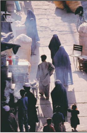
Afghans in a Kabul marketplace.

A fghanistan, one of the world's most impoverished countries, is slowly recovering from decades of war, oppression and, more recently, a devastating drought. A landlocked country in South Asia about the size of Manitoba, Afghanistan is home to a population of approximately 30 million people, slightly less than the Canadian population, who belong to several different ethnic groups and speak two official languages.