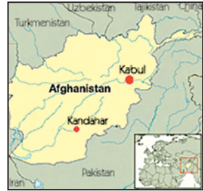
Map of Afghanistan.

A fghanistan, one of the world's most impoverished countries, is slowly recovering from decades of war, oppression and, more recently, a devastating drought. A landlocked country in South Asia about the size of Manitoba, Afghanistan is home to a population of approximately 30 million people, slightly less than the Canadian population, who belong to several different ethnic groups and speak two official languages.