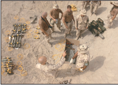
Members of 1 Combat Engineer Regiment Explosive Ordnance Disposal team prepare munitions for disposal at the Central Demolition Site in Kabul, Afghanistan.