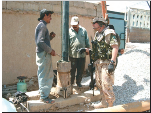
Maple Leaf, Vol. 7, No. 28, p. 4

Every spring the arrival of nomadic peoples from across Afghanistan in Qal'eh-ye Moheb, a small village outside of Kabul, causes friction with the residents due to lack of water. Recognizing this issue, the Canadian Forces civil-military cooperation (CIMIC) officers worked with local officials and an Afghan contractor to dig two wells with funding from the Canadian International Development Agency (CIDA).