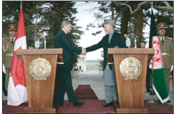
Prime Minister Stephen Harper shakes hands with Afghanistan's President Hamid Karzai, Kabul Afghanistan.

Meeting these challenges involves an integrated and coordinated approach. In leveraging resources and expertise across all levels of government, along with complementary engagement of military and Canadian civilians, Canada plays an active role in assisting the Afghan authorities and Afghan people in stabilizing the country, strengthening governance and reducing poverty.