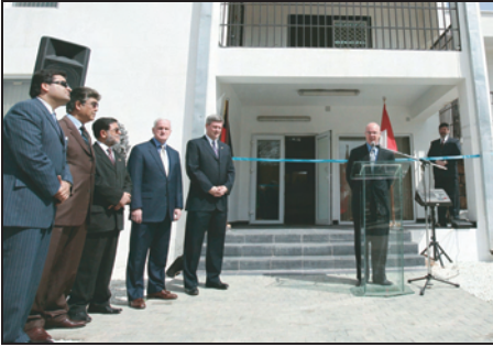
Inauguration of Canadian Embassy Chancery, Kabul, Afghanistan.

Canada re-established diplomatic relations with Afghanistan in January 2002, following the fall of the Taliban regime. We recently expanded the Canadian Embassy, which first opened in September 2003, in the capital city of Kabul.