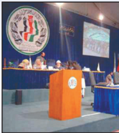
Loya Jirga, October 2004

Since 2001, Canada has contributed over $33 million to help the democratic process in Afghanistan. Canada fully supported the presidential election in the fall of 2004 as well as parliamentary and provincial elections in September 2005. More than 12 million Afghans – many times the expected number – registered to vote in these successive elections. In December 2005, the Afghan parliament sat for the first time in over 30 years, giving Afghans a voice and laying the foundation for a stable and prosperous Afghanistan.