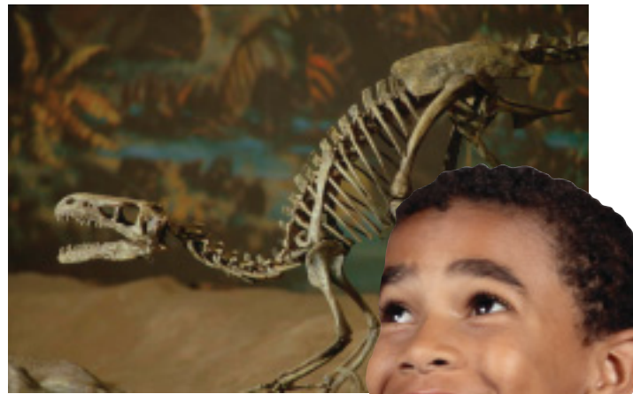
Dromaeosaurus Royal Tyrrell Museum

The Teachers' Centre is your gateway to discovery of a broad range of VMC resources that will appeal to you and your students alike. Your discovery gateway includes: