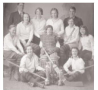
Red Deer Amazons Women's hockey team, 1932-1933

This fascinating weekly series, highlighting major events and milestones in Canadian history, is brought to you by Parks Canada in collaboration with the VMC.