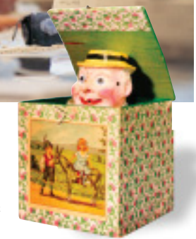
Jack-in-the Box Saskatchewan Western Development Museum