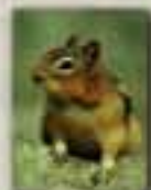
Golden-mantled ground squirrel

As snow retreats, plants flourish and bears range widely to find these green pockets.