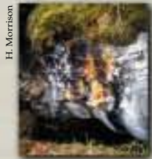
Black bear den

Both black and grizzly adult females have a physical adaptation called "delayed implantation"—the fertilized egg doesn't implant in the uterus unless the female has enough fat reserves to grow and nurse cubs. Born into a secure den environment, the tiny, blind cubs (usually two) suckle on their sleeping mother's rich milk.