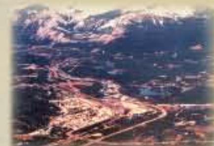
Sharing the valley with wildlife. The town of Jasper in Jasper National Park.

It's becoming harder for bears to avoid bumping into people even in our parks. These protected areas are an important part of the remaining habitat for black and grizzly bears in North America.