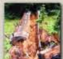
Ants and other insects in rotten logs