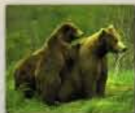
Sow grizzly and young cubs

Here in the Rockies, grizzly bear cubs may remain with their mothers for up to 5 years—learning the ropes for survival in the mountains. Female grizzlies aggressively defend their cubs from dominant male bears and other threats. Black bear cubs are ushered up trees for protection from adult black bear males and grizzly bears.